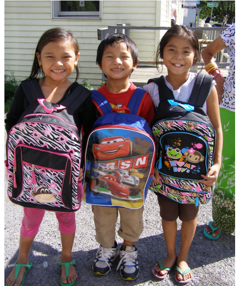
Karen refugee children in Syracuse proudly show off their new backpacks. Christ Community United Methodist Church refugee resettlement mission makes backpacks and school supplies a priority for new arrivals.

'Radical welcome... is based on having a relationship with God – one that empowers us to be vulnerable, take risks, and welcome the other.'